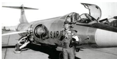
CAPT RADEMACHER BESIDE F-104