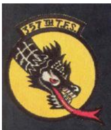
357th TAC FIGHTER SQUADRON PATCH