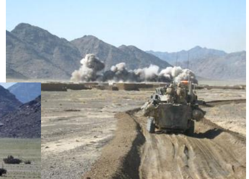
CAPTION IS: “NEUTRALIZING A TALIBAN STRONGHOLD”