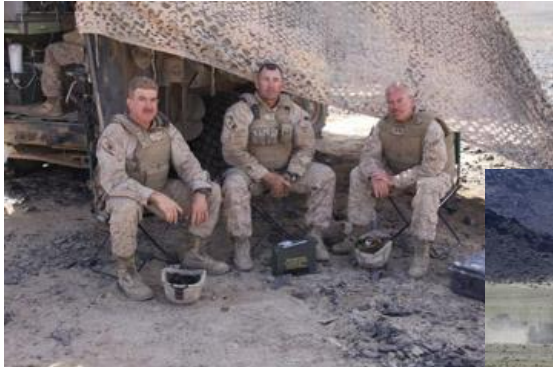
CAPTION IS: “A BREAK FROM WAR (CO, SgtMaj, Chaplain)”

“Breaking radio silence to inform you that the Campfire Girls candy arrived at our frontless frontlines of southern Helmand Province...What an absolute treat...The Marines who carried the large, refrigerator-sized boxes to me thought you sent us a couple of pony kegs...Admittedly, I was thinking (hoping) the same thing...The candy, however, is a welcomed delight. We’ve already torn through several of the packages, and the rest will be quickly consumed within the days to come... Many thanks for assisting in the delivery of the Campfire Girls thoughtful treats...The morale-boosting effects of the support we continue to receive from our fellow patriotic citizens from across the States are immeasurable...Semper fidelis