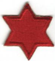
6th INFANTRY DIVISION SIGHT SEEING SIXTH PATCH

The division arrived in Hawaii September 20, 1943 and moved into positions manning the beach defenses of Oahu Island. They continued that mission for approximately four months and also had two weeks of intensive training in jungle warfare. In January 1944 they were shipped to New Guinea and set up camp at Milne Bay, a previously secured location near the extreme southeastern tip of the island. Bill says, “We were camped in a coconut grove at Milne Bay and spent the next several months in training.”