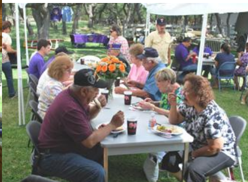
MUCH VISITING GETS DONE IN THE DINING AREA OF THE CHAPTER 1919 MESS HALL IN THE OUTDOORS