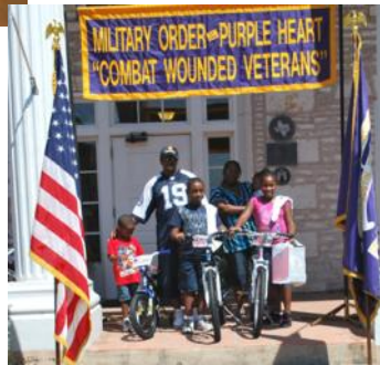
FINALLY, TWO OF THE EIGHT FAMILIES PICTURED HERE ON THEIR WAY HOME