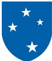
AMERICAL DIVISION PATCH